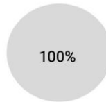
2. Alignement à la taxinomie des investissements hors obligations souveraines *