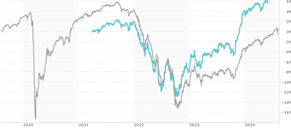
Wellington Higher Quality Global High Yield Bond Fund USD S AcH Benchmark: IX Anleihen High Yields