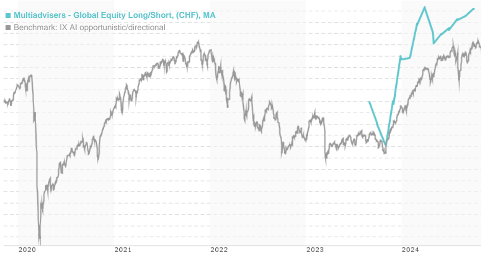
■ Multiadvisers - Global Equity Long/Short, (CHF), MA ■ Benchmark: IX AI opportunistic/directional