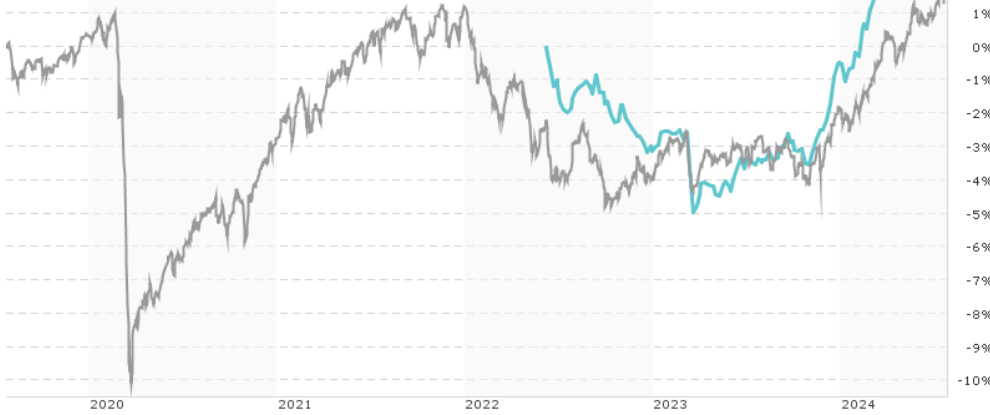
LO Funds - Multiadvisers UCITS, X1, (EUR) MA Benchmark: IX AI Multi-Strategy