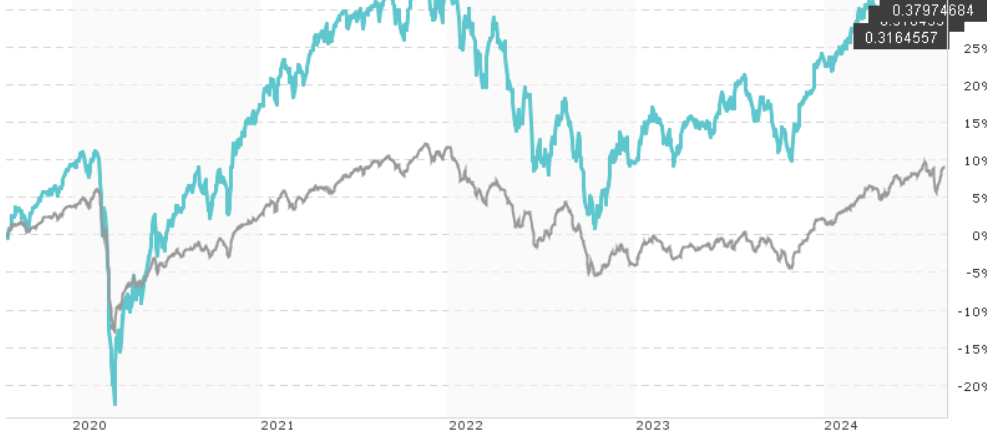
■ HSBC Portfolios - World Selection 4 AMFLXHSGD ■ Benchmark: IX DF Mischfonds Multiasset