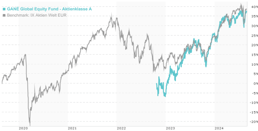
■ GANÉ Global Equity Fund - Aktienklasse A ■ Benchmark: IX Aktien Welt EUR