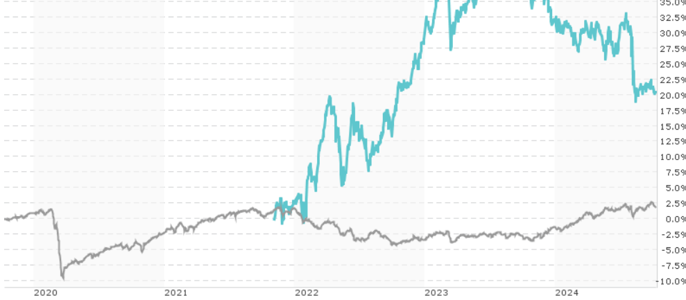
■ THEAM QUANT - CROSS ASSET HIGH FOCUS - M Capitalisation ■ Benchmark: IX AI Multi-Strategy