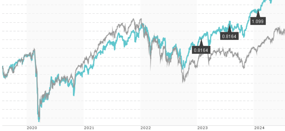
AMUNDI FUNDS EUROPEAN EQUITY INCOME ESG - A2 EUR SATI Benchmark: IX Aktien Europa EUR