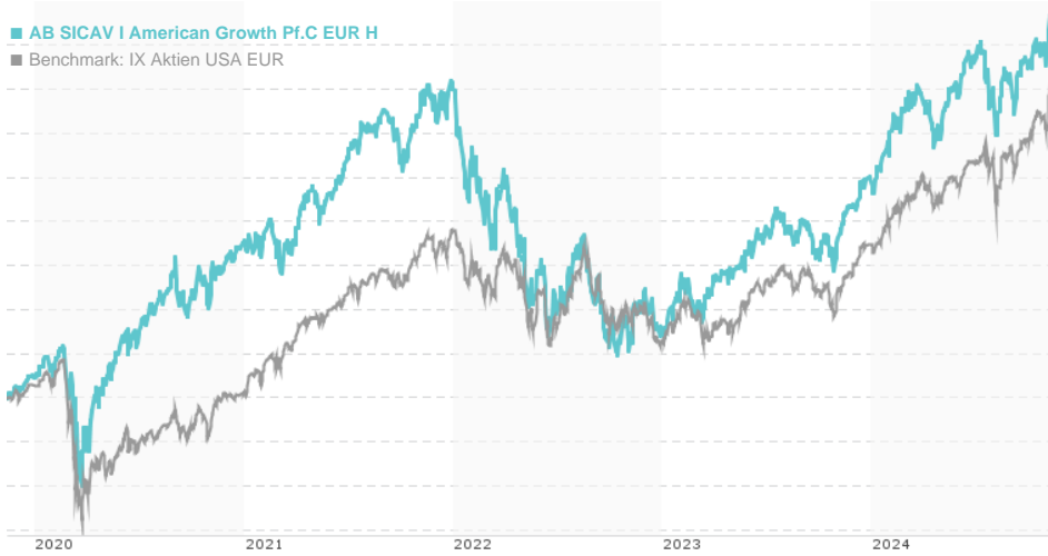
■ AB SICAV I American Growth Pf.C EUR H ■ Benchmark: IX Aktien USA EUR